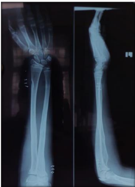
Figure 5: Post Implant removal

of the study. Informed written consent was taken. Data was entered in Excel sheets, and qualitative and quantitative analysis was done using SPSS 22.