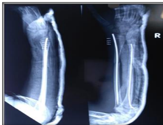
Figure 2: Post-op: TENS nailing done