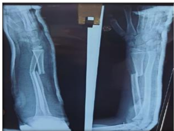
Figure 1: Pre-op x-ray showing displaced both bone forearm fracture

Postoperatively, an above-elbow slab was given to encourage soft tissue healing. Parenteral antibiotics were given for three days, then oral antibiotics were changed. Active finger and elbow exercises were started at the earliest possible. Implant removal was done six months postoperatively after seeing the radiological union. The patients were followed up for a minimum period of 6 months. The subjective, objective, and radiographic findings were quantified according to Price et al.'s criteria and radiological findings.