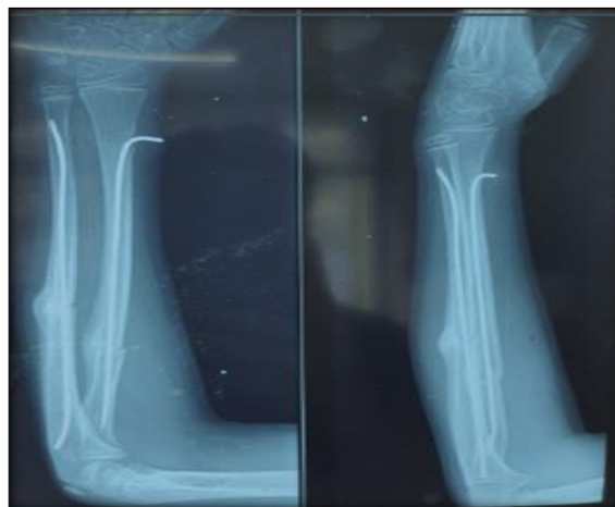
Figure 3: Post-op 4 weeks